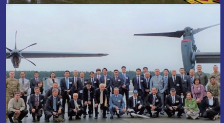
Conduct study tours of USAF Base in Japan