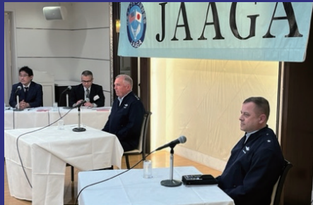
Lecture by Commanders and Generals of Koku-Jieitai and USAF