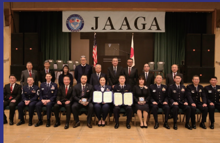
Commend Koku-Jieitai & USAF Brilliant Airmen