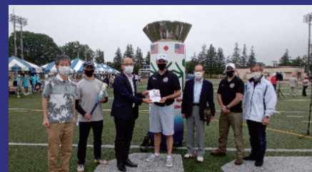
Support USAF members to organize local activities "Special Olympics"