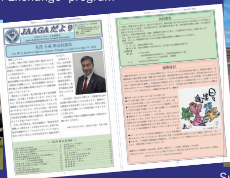
Publish the JAAGA DAYORI