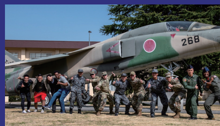
Encourage participants in Japan-US Bilateral Exchange program