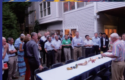
Visit the US for participating in AFA general meeting, exchanging views with Generals, reuniting with honorary members, etc.