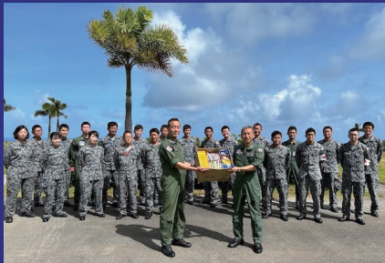
Encourage participants in overseas joint trainings